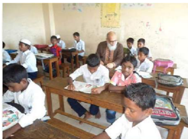
DAM President is seen in the class room with AMCC Students of grade IV

Education: AMCC has created ample opportunity of education for children. Children are admitted into appropriate classes at AMCC's school according to their age. Based on the class a student is in he gets a chance to study English, Bengali, Math, Religious and moral studies, Social Science, Geography, Primary science, Agricultural Studies, Environment and Health Studies, Physical Health Studies, Computer Studies along with Music, drawing, Reading. In order to evaluate