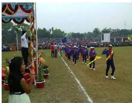
Scouts of AMCC are marching past the DC Panchagarh and saluting

AMCC always keeps the children interest above everything. In this regard, discussions and meetings with them are very frequently organized to know if they are enjoying the services provided by AMCC. Besides, Children participate in the open discussion on every Tuesday where they expose their desires, needs and problems in presence of staffs and teachers. There has been a provision of opinion box so that children can inform their hidden problems confidentially. From these attempts the AMCC staff gather suggestions from the children what they like and dislike. Accordingly measures were taken to satisfy their needs and demands. They also take part in various training sessions and learn various aspects. They also enjoy the picnics, day outs, the students' council and their activities and the scout team they formed. They like to celebrate different festivals, like Eids and observe days, such as the Victory Day, Independence Day, Children's Day, and International Literacy Day etc. The children stated