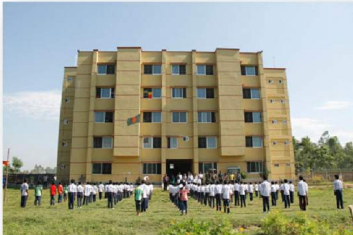
Children are standing in line during PT before class

Thousands of children on the streets of Bangladesh are being denied their rights according to the United Nations Convention on the Rights of the Child (UNCRC), which recognizes that every child is entitled to a standard of living adequate for the child's physical, mental, spiritual, moral and social development. Although Bangladesh has ratified the Convention on the Rights of the Child and the ILO Convention 182 concerning the elimination of the worst forms of child labor, there is no legal framework for children who work in informal sectors, such as street vending or domestic labor.