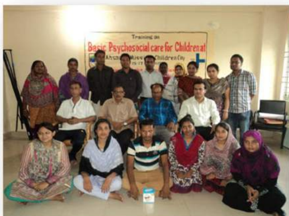
Pscho-social training participants are seen posing during the training session

Training: Under the guidance of an agriculture supervisor, AMCC's children are cultivating different vegetables by themselves. Children are getting practical training on gardening, farming, plant care, etc. Children planted 5 lychee plants, 15 mahogany plants, 15 guava plants, 48 mango plants, 14 bay leaves etc. They also cultivated different vegetables, such as radish, red spinach, and pumpkin. Children also took part in upbringing 2 cows, 20 hens and 2 pigeons.