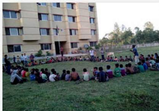
Children sitting in round shape on children day held every month.