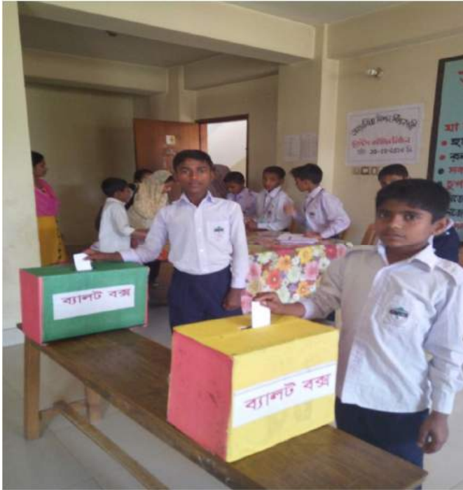
Students casting votes in the student council election

the center, AMCC is giving emphasis to develop qualities like respect to democratic practices, social values and norms, tolerance to different opinions, help teachers in taking classes and take part in every development activity of AMCC. In order to make sure participation of the children in development activity and building a sense of responsibility and leadership among children, student council election is held every year. This year election was held in March 2016 with huge zeal and enthusiasm among children. Election schedule was declared a month's ahead for 7 posts of student council. To conduct the election one election commissioner, one presiding officer and two polling officers were employed from among