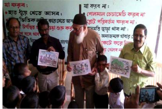
AMCC children presented their hand drawn sketches to DAM President and others