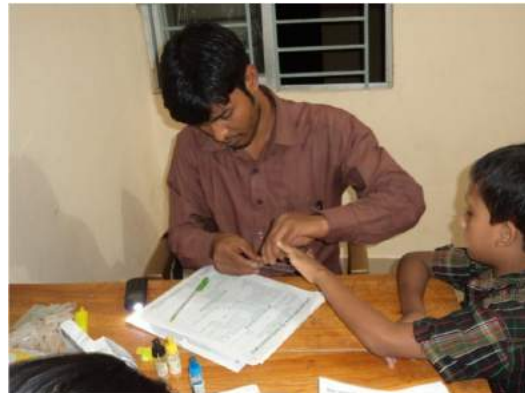
Regular health check

Health Care: In the AMCC, paramedic is responsible to ensure regular health check-up and provide necessary guidance to maintain a healthy and clean environment in the center. Children's height, weight, eyesight power are checked and recorded. Especially at the time of enrolment children were found with different diseases. During this reporting period many children were treated such as psora 36, scabbies 97, chicken pox 32 etc. Four children were consulted to ENT expert. 79 sick children were taken to Sadar Hospital. 36 children were circumcised from local hospital free of cost.