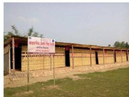
Temporary school of AMCC