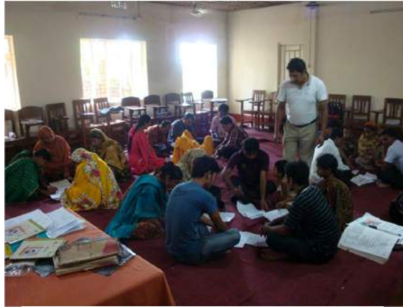
Staff Training session