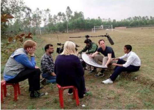
Media team is recording interview of Children