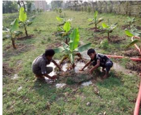
Children working in agriculture field

local farmers were consulted to know the indigenous process of cultivation. As a result of the regular association with agricultural activity children learned when to plant which crops, how to protect crops, how to apply fertilizer and irrigation etc. Now dairy and poultry farming in AMCC are in good condition. Last year children grew mustard seed and wheat in the agriculture field and produced mustard oil and wheat flour and packed them in bottles and sachets and sold them in the DAM head office employees.