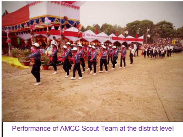
Performance of AMCC Scout Team at the district level