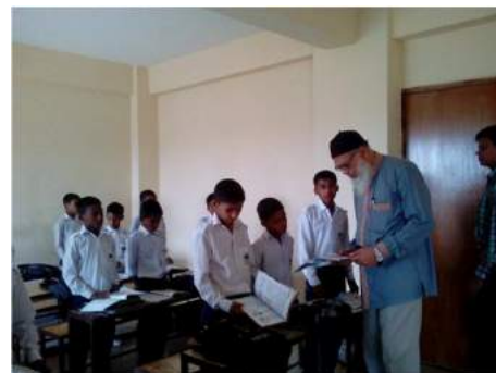
President of DAM visiting a class

Education: AMCC has created a learning environment in the whole campus. Children are attending appropriate classes at AMCC School according to their age and levels. Students are taught Bengali, English, math, moral studies, social science, geography, general science, agricultural, environment and health studies, computer science along with music & drawing. In order to assess their progress in education monthly, 1 st term, 2 nd term and final exams are being held regularly. There are full time teachers, para-teachers, part-time teachers and education coordinator responsible to provide supports to the students in their study. Children were encouraged and motivated to perform well in the