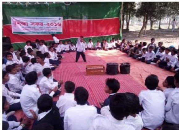
Children went to Rangpur on education tour

where they reveal their desires, needs and problems in presence of AMCC