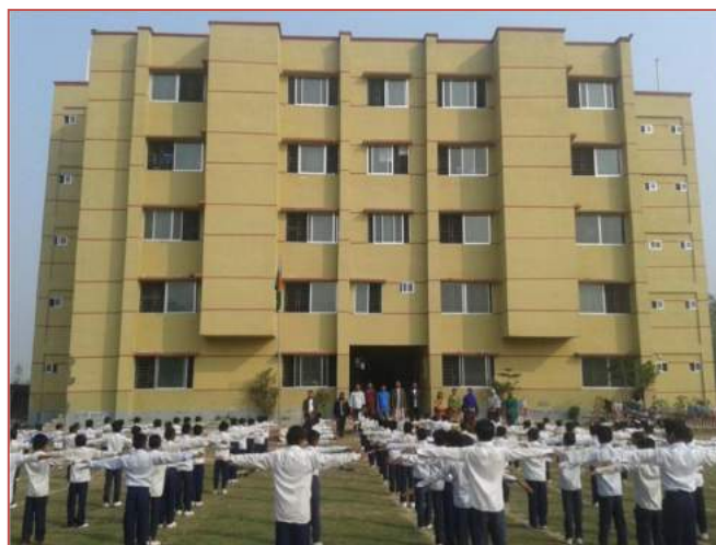
Student's assembly in front of AMCC building

Cities in Bangladesh are overcrowded with compact slums, unlawful occupants, squatter settlements and pavement dwellings. Increasing rural poverty and corresponding urban migration continue to swell the numbers of people living in urban slums and on the streets. Moreover, rural unemployment, landlessness, river erosion, natural disasters, family conflicts and weak law and order because rural families to leave their homes in search of better prospects in the urban centers. This movement